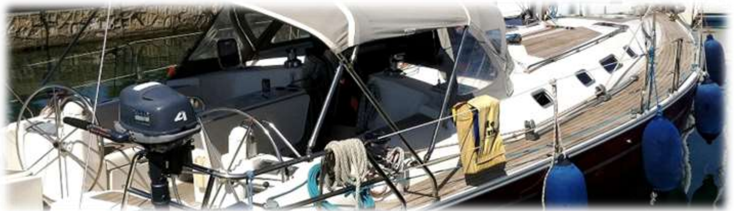
' ALPHA 51' – Plan / Spécifications / Photos originales

Electronics: Radar + Autopilot + GPS-Chart plotter + EPIRB + VHF + Wind instruments + Sonar + CD player stereo.