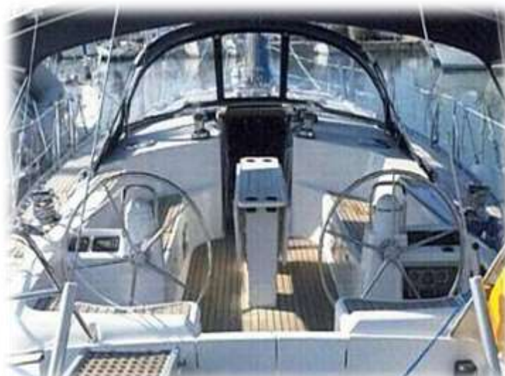
'ALPHA 51' – Plan / Spécifications / Photos originales