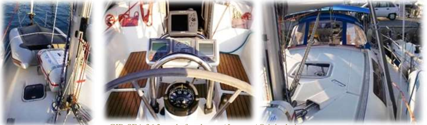
GIB-SEA 36,2 ready for charter / Layout / Original pictures